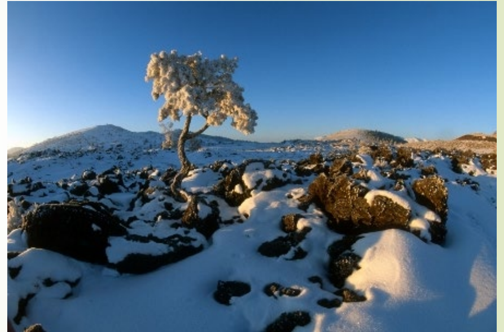
Craters of the Moon National Monument & Preserve United States NPS