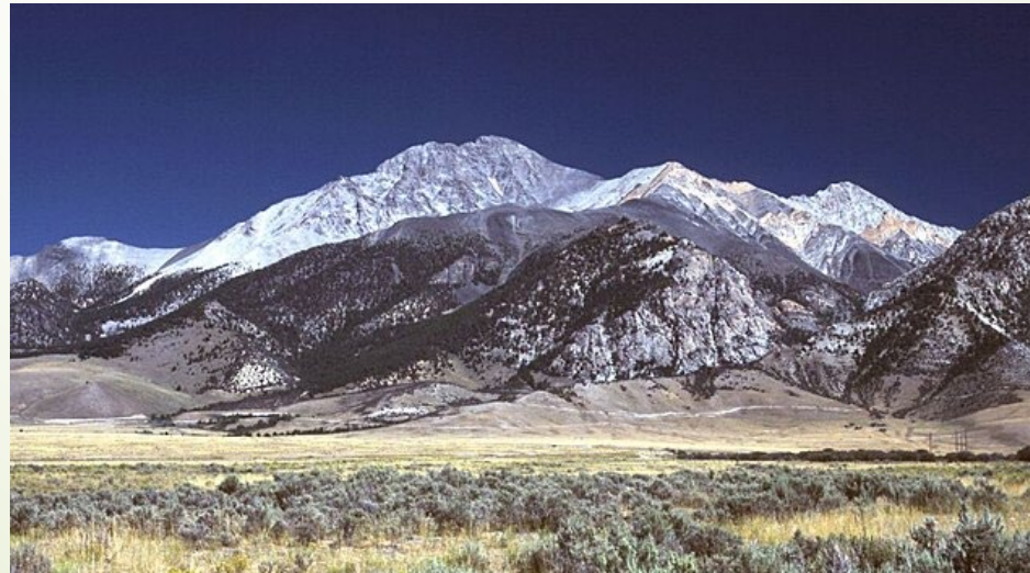
Lost River Range Wikipedia