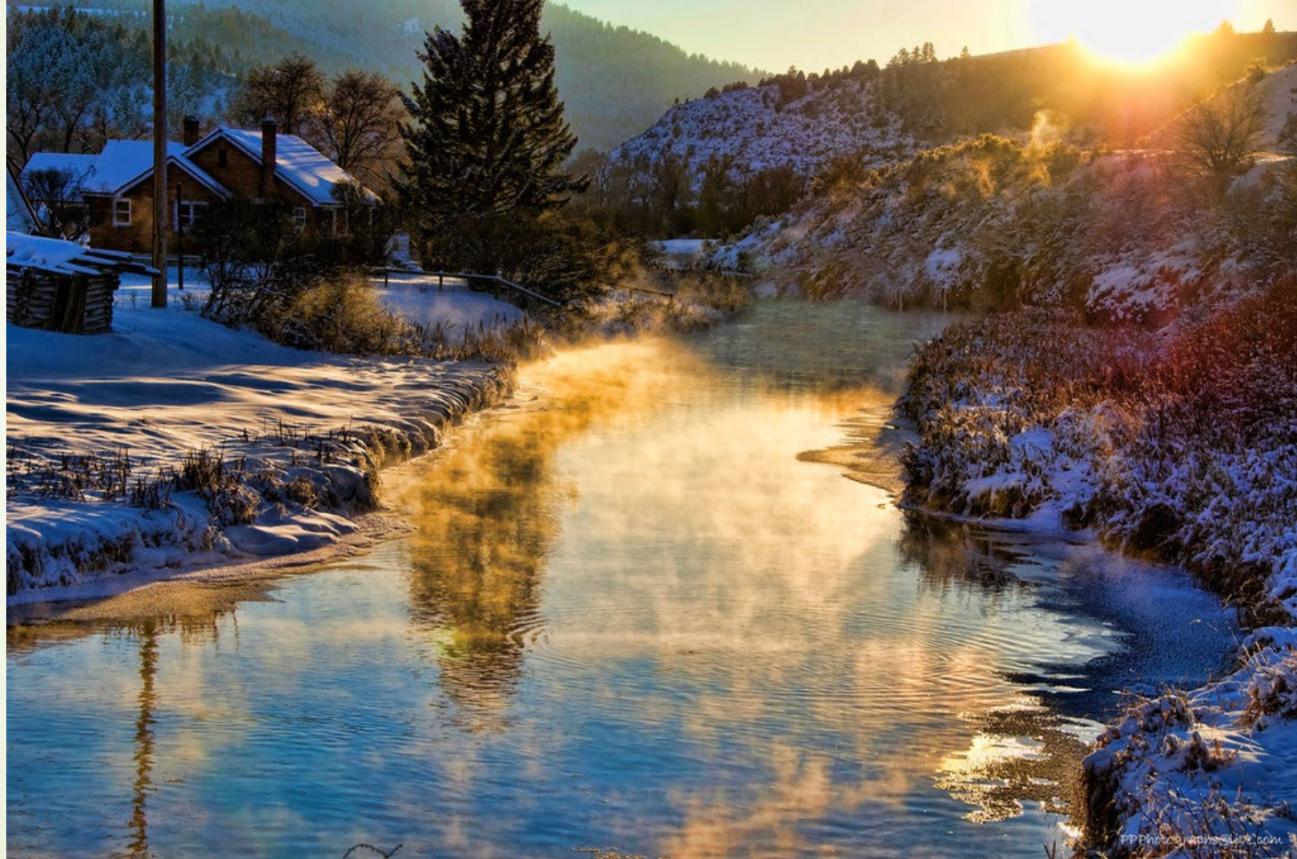
Rainey Creek in Swan Valley