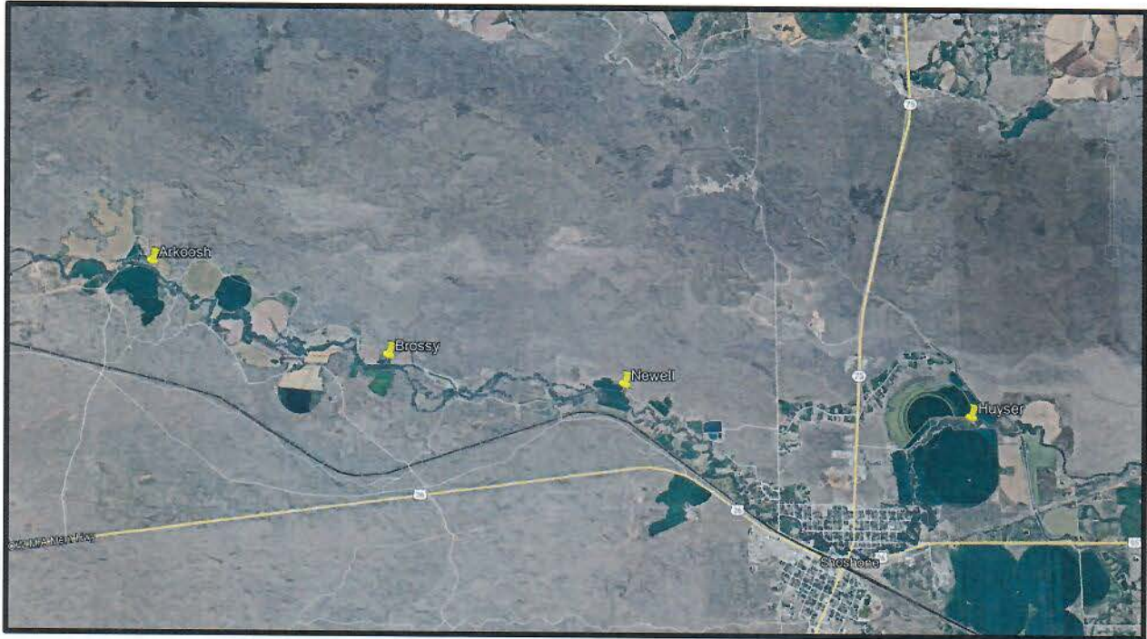
2025 Storage water delivery locations (Google Earth imagery)