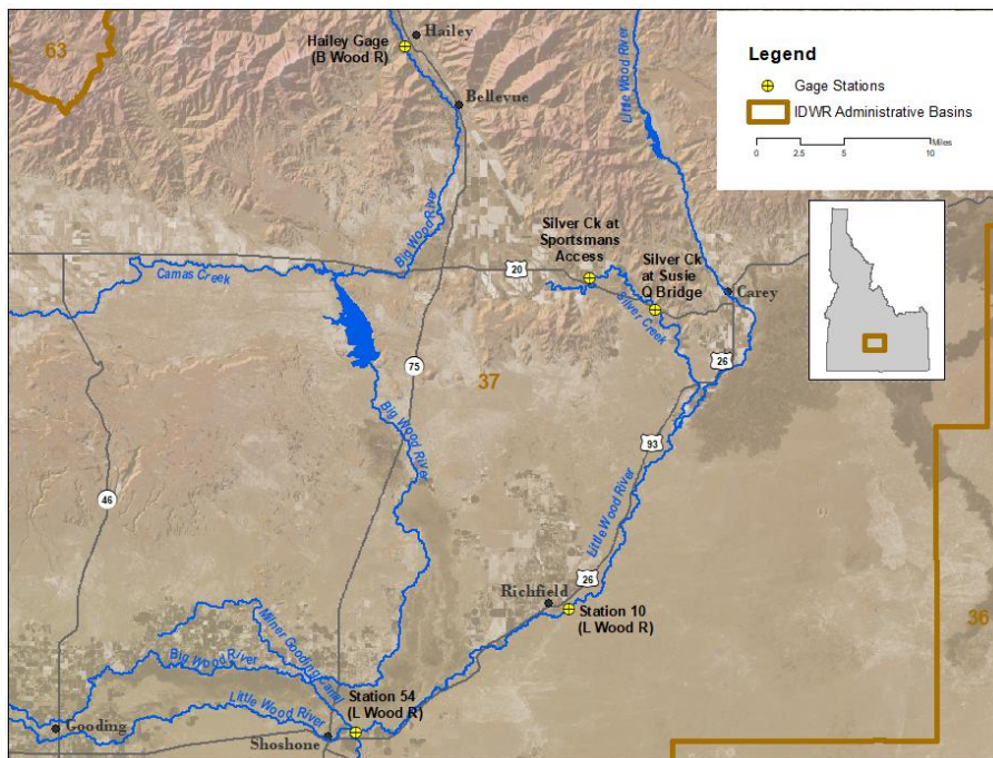
Figure 1. Gage Station Locations

For DWRCWMA ground water users who participate in and abide by the terms of this Management Plan, adoption of the Management Plan establishes safe harbor from curtailment under Idaho Code 5-42-233b.