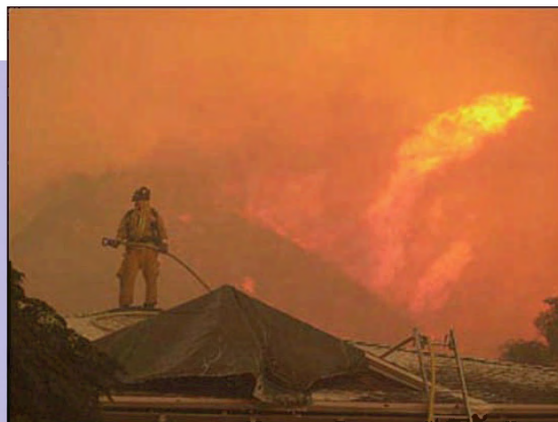
Climate change could result in an extended fire season.