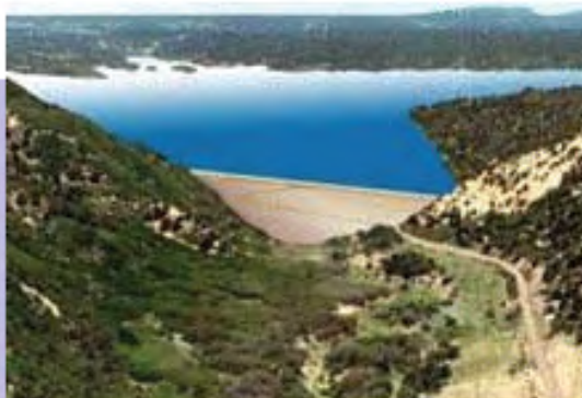
Artist's rendition of completion of Ridges Basin Dam, being built pursuant to implementation of the Colorado Ute Settlement Act of 2000.

It has long been the accepted premise that meeting the cost of Indian water and infrastructure in Indian water rights settlements is the trust responsibility of the federal government. At the same time, it must be acknowledged that an appropriate share of these costs of settlement, which correspond to non-Indian water and infrastructure benefits, increasingly a component of Indian water rights settlements, should be borne by the states. The states and the federal government must work together to jointly design and fund settlement projects that provide the greatest benefit for Indian and non-Indian water users alike in those situa-