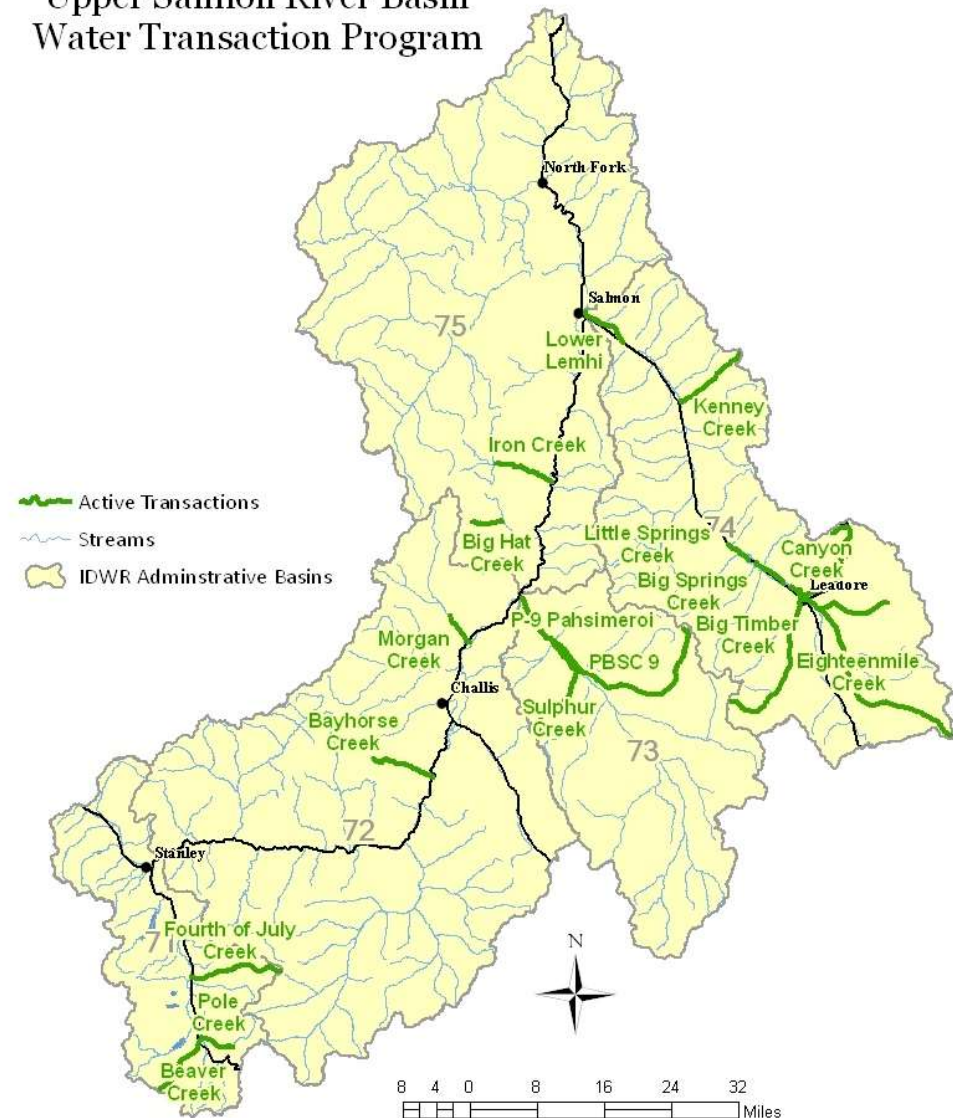
Upper Salmon River Basin Water Transaction Program