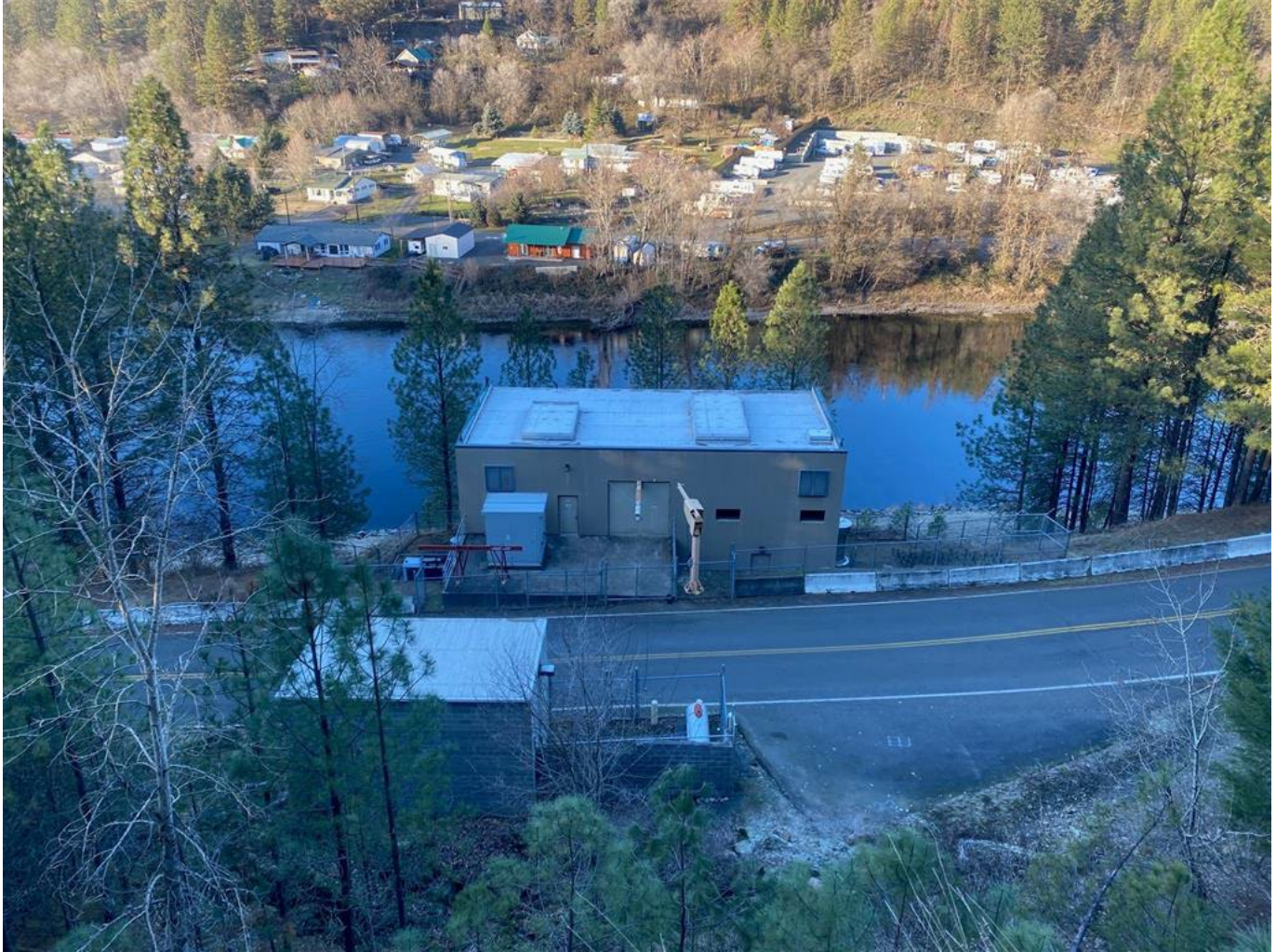
Figure 1: Dworshak Small Hydro Power Plant

The Power Plant was constructed in June of 2000 for a cost of $5.5 Million. The Plant's output, approximately 17.5 GWh per annum, is transmitted to the Bonneville Power Authority through a wheeling agreement with the local power utility, Clearwater Power.